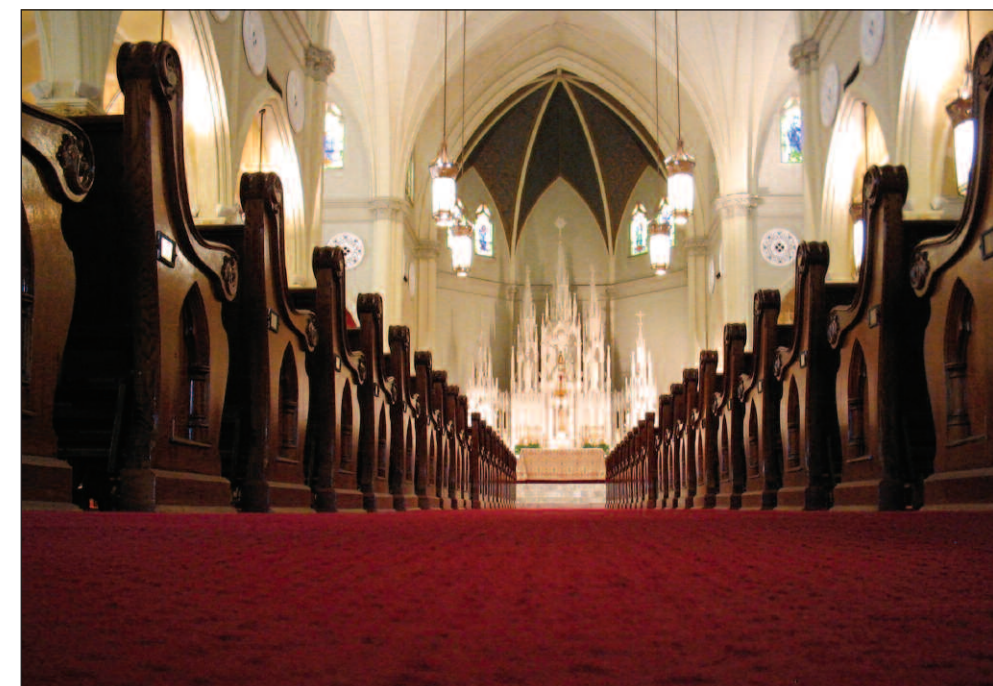
The view from the back of the cathedral.