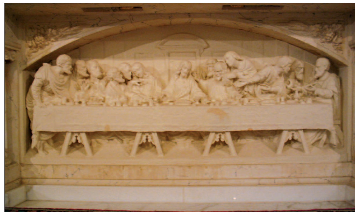
The congregation now has a full view of the bas-relief sculpture of Leonardo Da Vinci's famous painting, "The Last Supper," that graces the front of the altar.