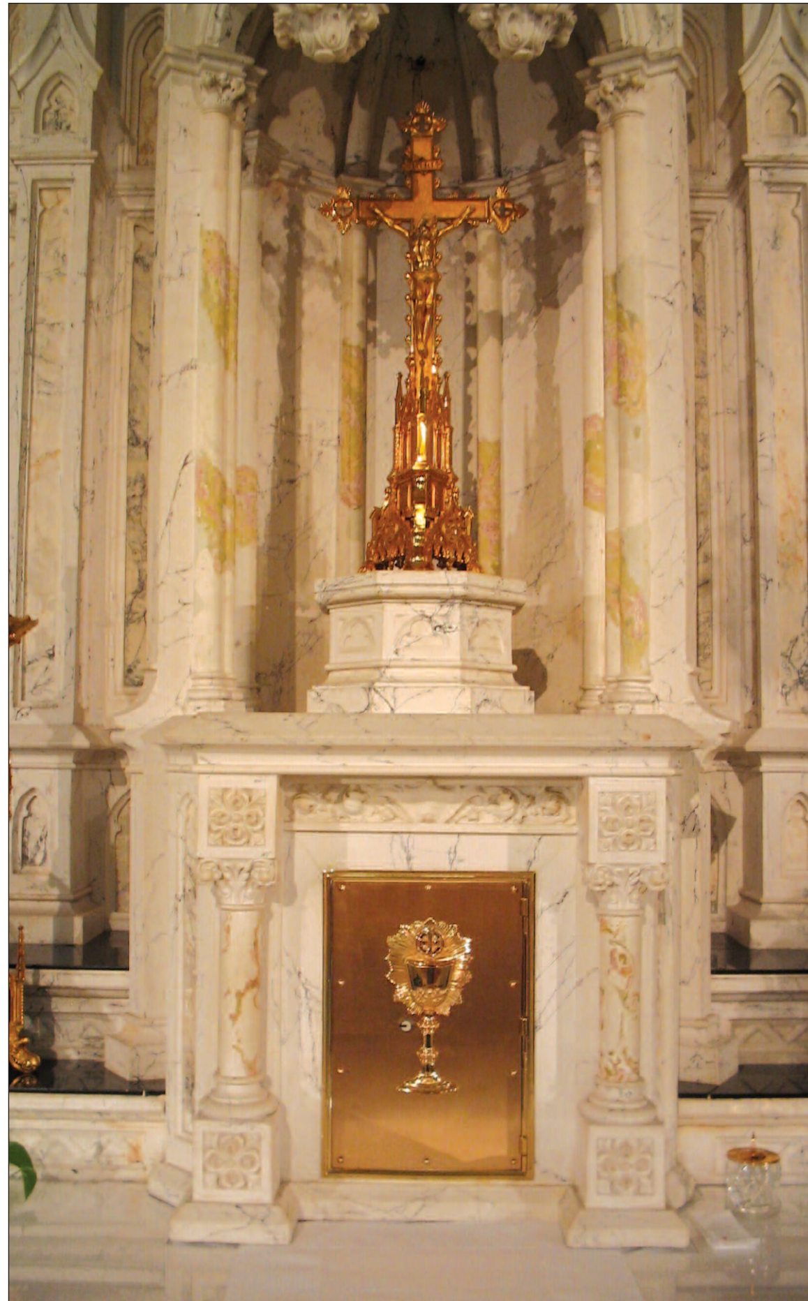
The Tabernacle has been moved back to the center of the High Altar, and following restoration the door shines bright.