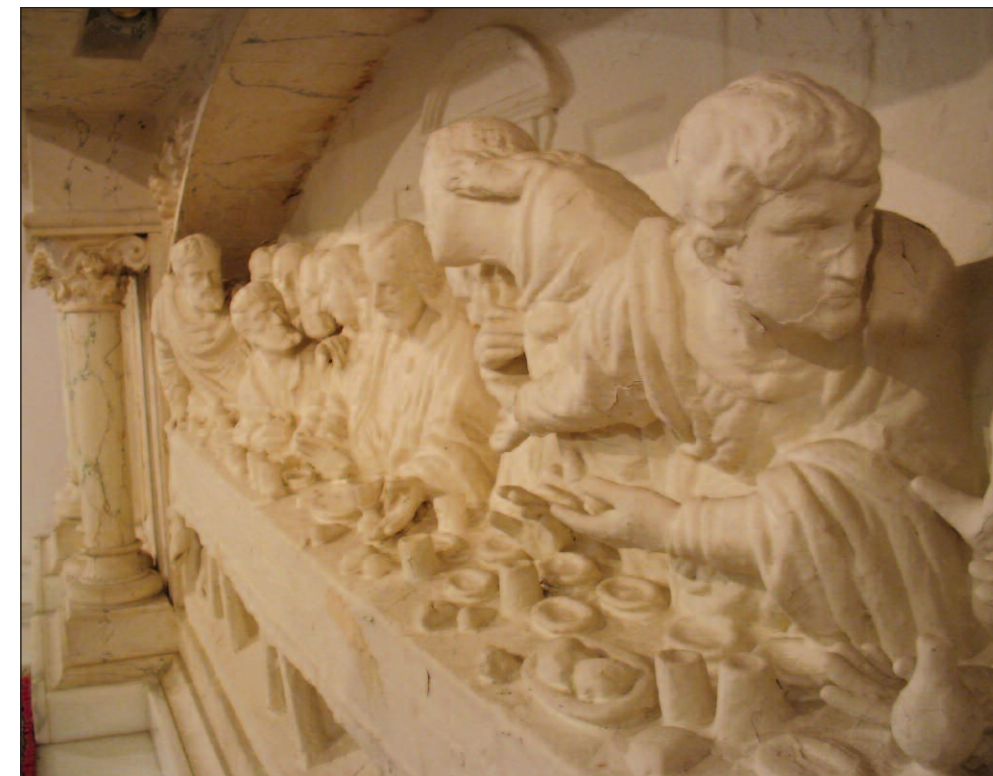
Very few visitors get to see the sculpture's detail work up close.