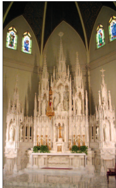
The altar stands 50 feet tall.