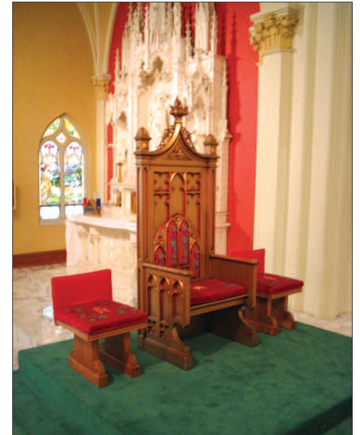
The cathedra, the Bishop's chair, is seated on a raised platform carpeted in green, a color associated with bishops. The cathedral gets its name from the cathedra.