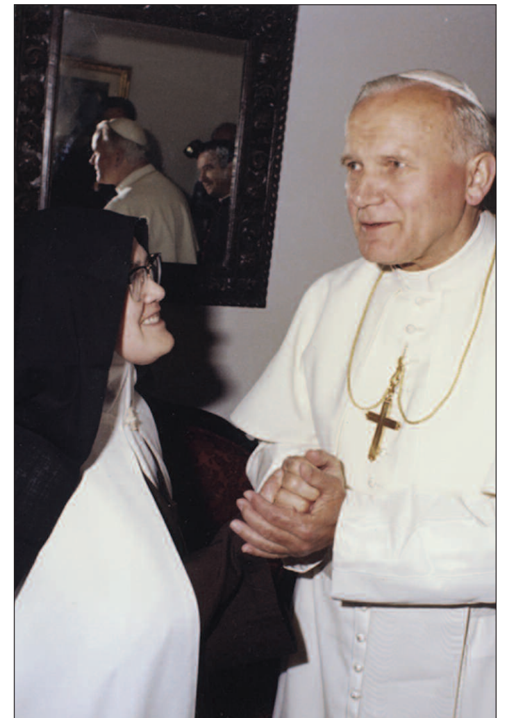
Pope John Paul II meets with Carmelite Sister Lucia dos Santos May 13, 1982. One year earlier, the pope survived an attempted assassination at the Vatican. The pope, in thanksgiving that his life was spared, had one of the bullets that struck him embedded in the crown of the statue of Our Lady at Fatima.