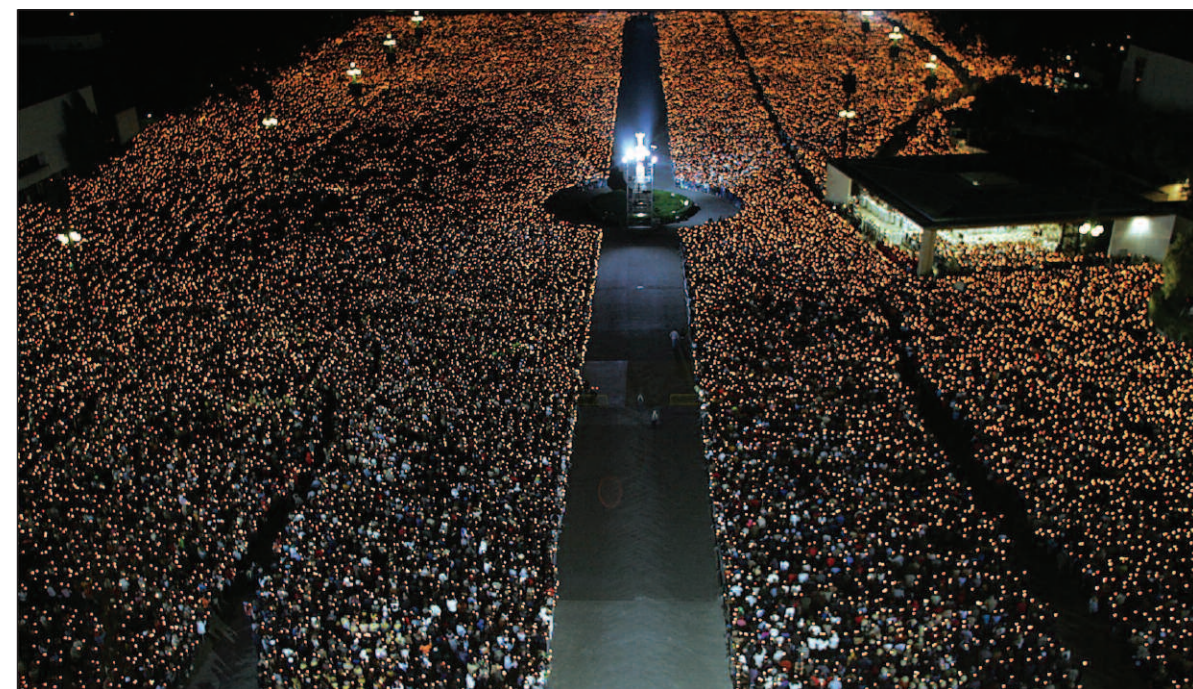
More than 400,000 pilgrims gather at the Shrine of Our Lady of Fatima in central Portugal May 12, on the eve of the anniversary of the first apparition at Fatima in 1917.