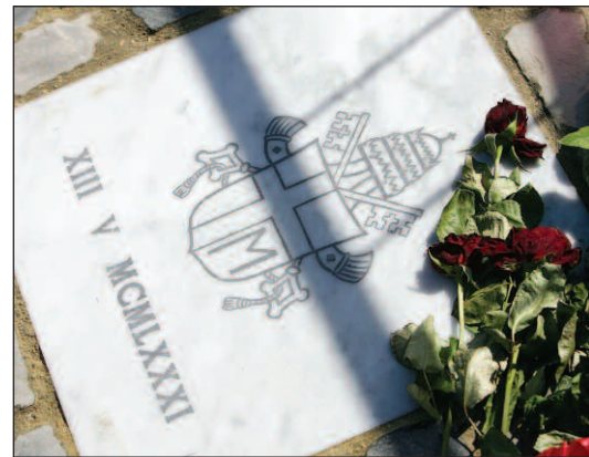
A marble plaque, placed in St. Peter's Square May 13, marks the spot of the assassination attempt against Pope John Paul II May 13, 1981. The shooting took place on the feast of Our Lady of Fatima, and the late pope always credited Mary with saving his life.