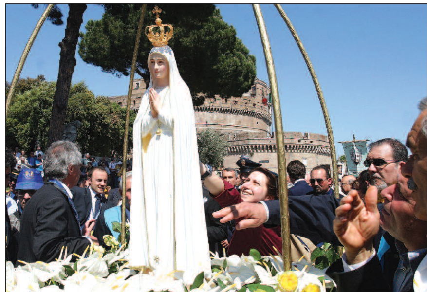
The statue is carried in procession from Castel Sant'Angelo to St. Peter's Square at the Vatican May 13.