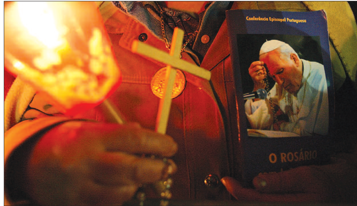
A pilgrim holds a booklet bearing an image of Pope John Paul II during a candlelight vigil at the Shrine of Our Lady of Fatima in Portugal May 12. More than 400,000 pilgrims converged on Fatima to celebrate the May 13 anniversary of the first apparition of the Virgin Mary to three shepherd children in 1917.