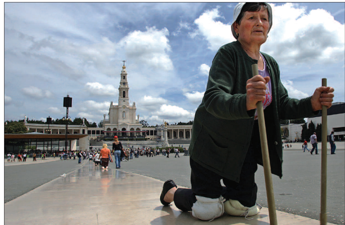
A pilgrim prays on her knees at the shrine of Our Lady of Fatima in Portugal May 12.