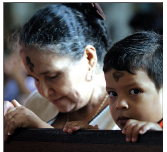
A child and his grandmother are seen after receiving ashes on their foreheads at an Ash Wednesday Mass in Panama City, Panama, Feb. 21.