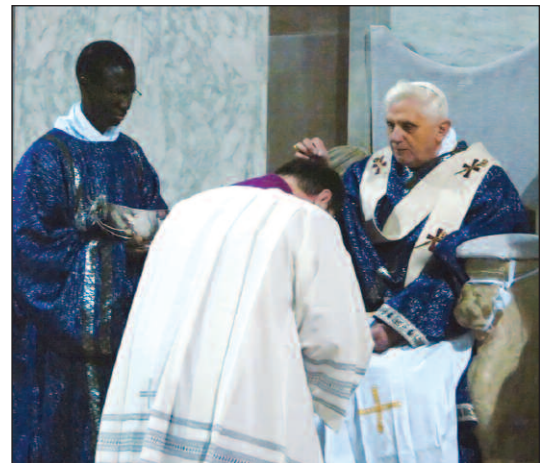
Pope Benedict XVI distributes ashes during a Mass on Ash Wednesday at the Basilica of Santa Sabina in Rome.