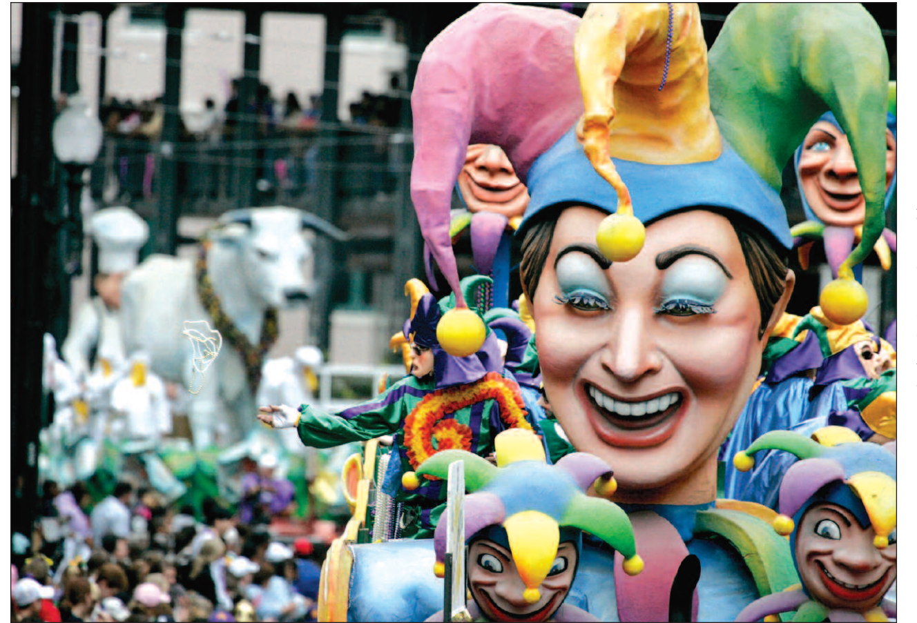
Prior to the solemnity of Ash Wednesday, members of the Krewe of Rex parade down St. Charles Avenue during Mardi Gras in New Orleans Feb. 20.

I wish you, dear brothers and sisters, a fruitful Lenten journey, imparting with affection to all of you a special apostolic blessing.